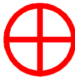
Fig 1 DZD Graticule Pattern 88